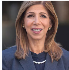
SUMMER STEPHAN DISTRICT ATTORNEY